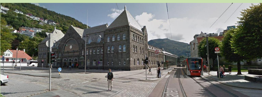
Bergen Railway Station, Strømgaten 4, 5015 Bergen

At Voss you change between bus and train. The Voss Railway station is right next to the bus terminal. The railway station has 3 tracks and your departure track will be clearly indicated on the notification boards and signs. The train is operated by: VY