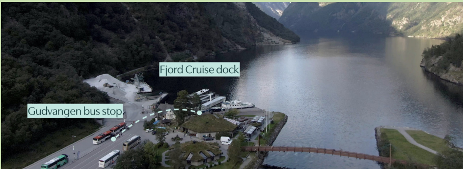
Gudvangen Harbour & Bus Stop

From Flåm you continue your tour by taking an electric fjord cruise to Gudvangen through the stunning UNESCO listed Nærøyfjord. The dock is located about 50 meters from the railway platform. The fjord cruise is operated by: The Fjords