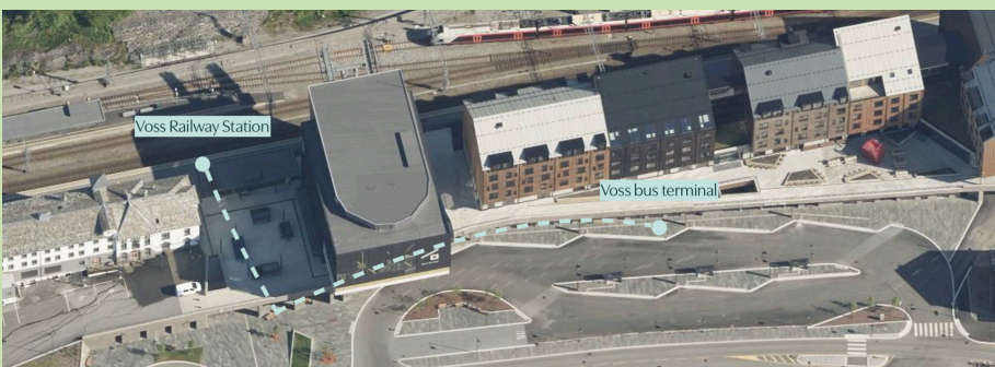
Voss Railway Station & Bus Terminal, Stasjonsveien 5, 5700 Voss

The bus has sign for Norway in a Nutshell®/Voss and is operated by Tide Bus.