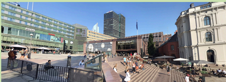
Oslo Central Station, Jernbanetorget 1, 0154 Oslo